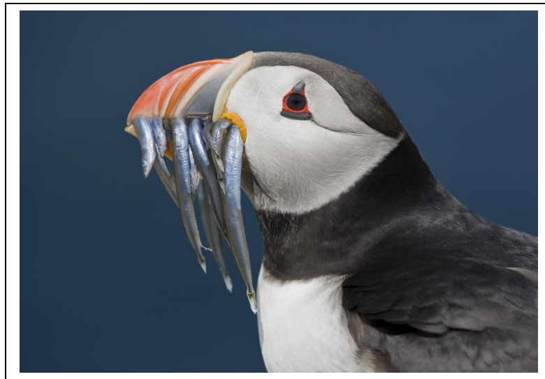
Atlantic Puffin – Steve Race

The seabird breeding season is in full swing as nearly half a million seabirds cling to the cliffs. Breeding Tree Sparrows, Common Whitethroats, Corn Buntings, Eurasian Skylarks, Common Linnets, Reed Buntings, Rock Pipits and Meadow Pipits are often viewed at Bempton too. A range of the more common butterflies may be seen on sunny days, along with day-flying moths such as Cinnabars, Burnet Moths and occasionally Hummingbird Hawkmoths .