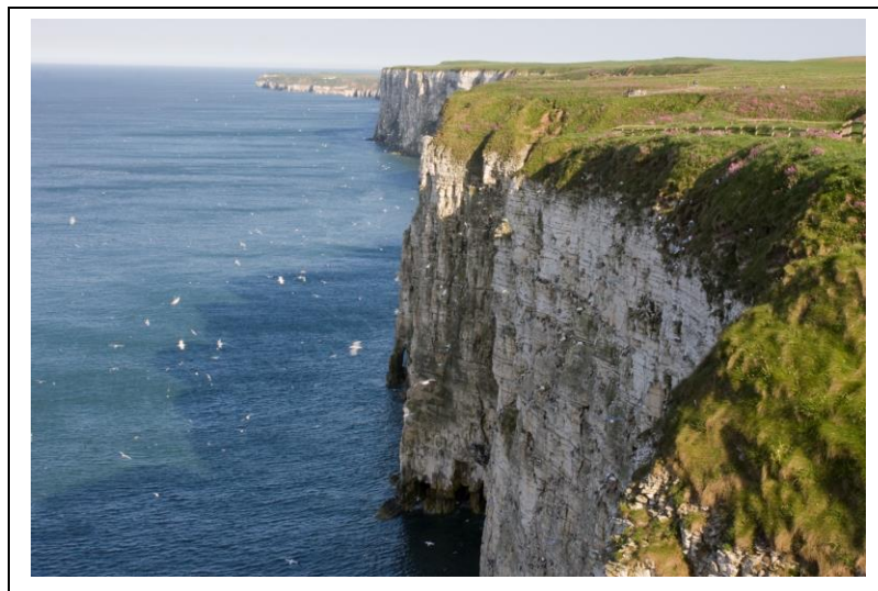
Bempton Cliffs

But it's not all about the cliffs. In spring and summer Corn Buntings, Skylarks and Linnets breed in the grassland and scrub where land meets the sea, while Short-eared Owl's hunt under wide open skies in winter.