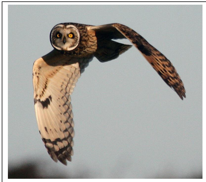
Short-eared Owl – Richard Baines

Winter is usually a quieter time of year, but a small number of Short-eared Owls and Barn Owls can usually be seen. The wildlife garden at the RSPB reserve offers food and shelter to a range of more common garden birds, as well as well as a colony of rare Tree Sparrows .