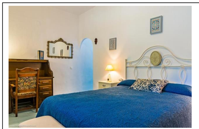
Cortijo el Indiviso, Manzanete