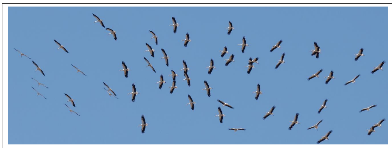
White Stork migrating in their thousands! Tarifa trip August 2022

Pre-breakfast woodland birding around hotel grounds, transfer to Gibraltar airport.