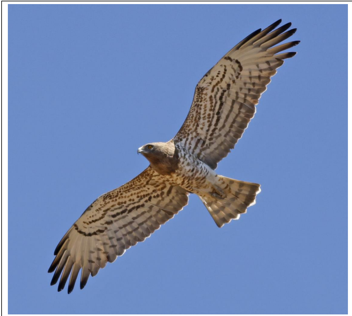
Short-toed Eagle Yorkshire Coast Nature Tarifa trip August 2022

Join us on a very special seven-day tour with expert guides. The spectacular bird of prey migration through the Straits of Gibraltar is legendary! Our tour includes flights, full board, all transport, amazing birding on land, and a pelagic boat trip in search of seabirds, whales and dolphins.