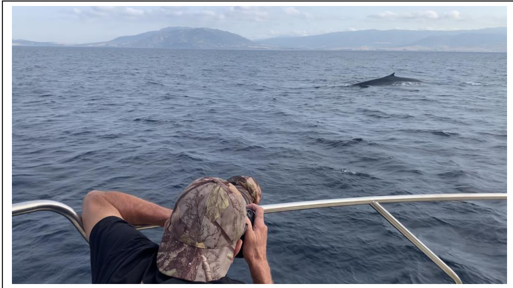
Fin Whale Tarifa trip August 2022