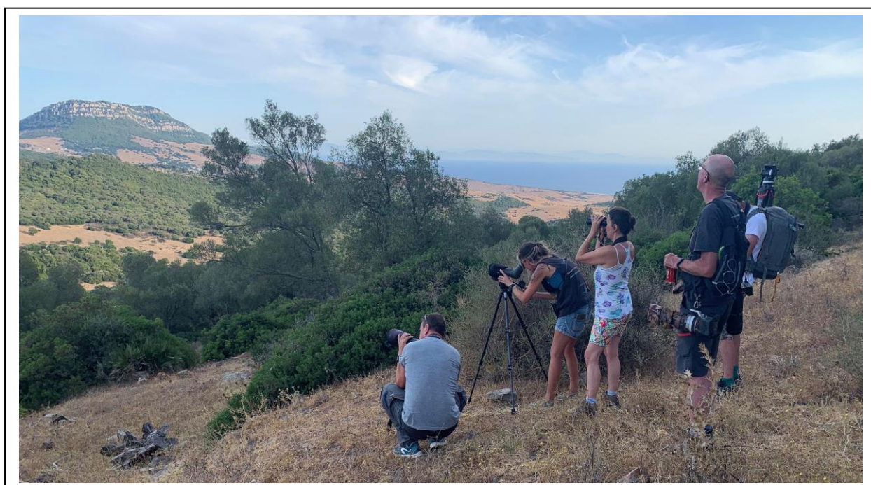
Raptor watching