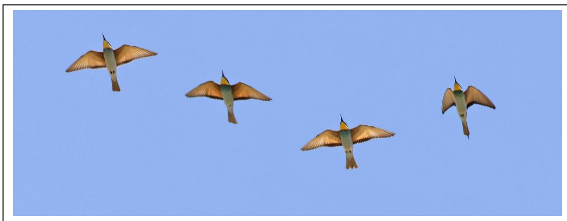
Bee-eater squadrons make their beautiful calls as they migrate to Africa in their hundreds Tarifa trip August 2022