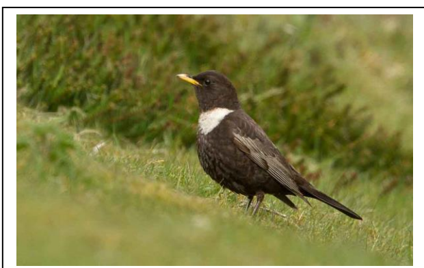
Ring Ouzel