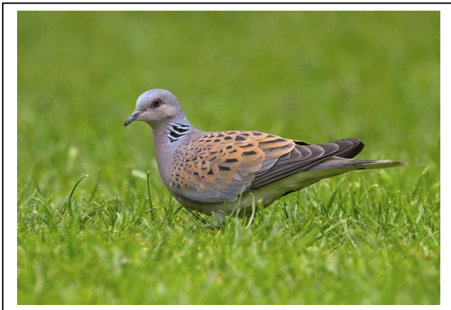
Turtle Dove

Every effort will be made to conduct the tour; however, in exceptional circumstances such as severe weather, Yorkshire Coast Nature reserves the right to change the content, guides or cancel the tour at short notice. In the event of cancellation by Yorkshire Coast Nature or Highfield Farm a full refund of the tour costs will be made. If you have any queries prior to the tour please call us on 07747753260.