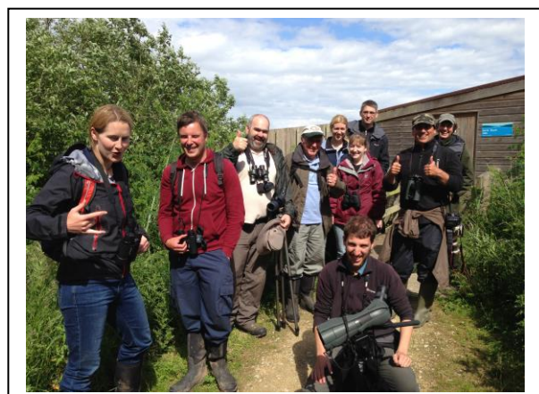
Happy clients on YCN tour 2014