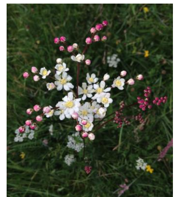
Dropwort