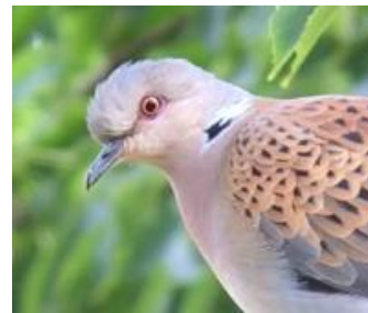
Turtle Dove