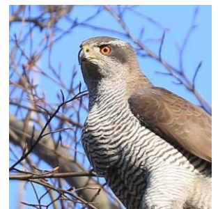
Goshawk