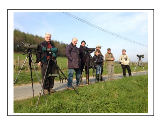
Happy clients on YCN tour 2015