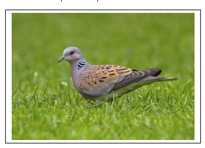
Turtle Dove

Cost and What's Included: £385.00 per person based on a single room. Reductions available for sharing please enquire for prices. All food, guiding and transport included. Pick up and drop off from local train station available on prior arrangement.