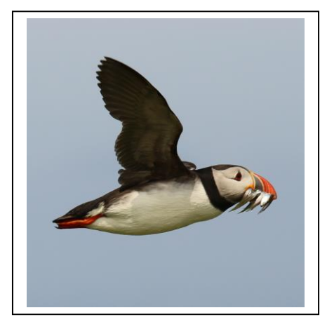
Puffin