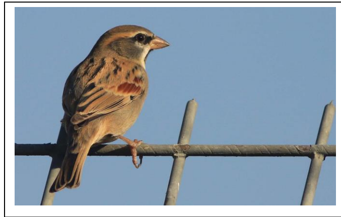
Dead Sea Sparrow

Eagles, Harriers, falcons and more. After a full day in the field, we will head back for a delicious home-cooked dinner and daily summary at the Jordan Valley Birding Centre Lodge, which is where we will spend the night.