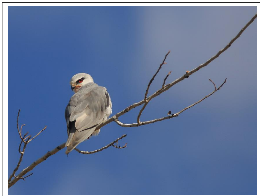
Black-shouldered Kite

Israel is a modern, comfortable and safe country to visit, offering fantastic infrastructure, great accommodation and famous hospitality following unforgettable days in the field.