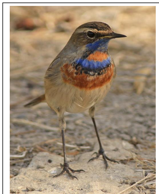
White-throated Kingfisher and Bluethroat