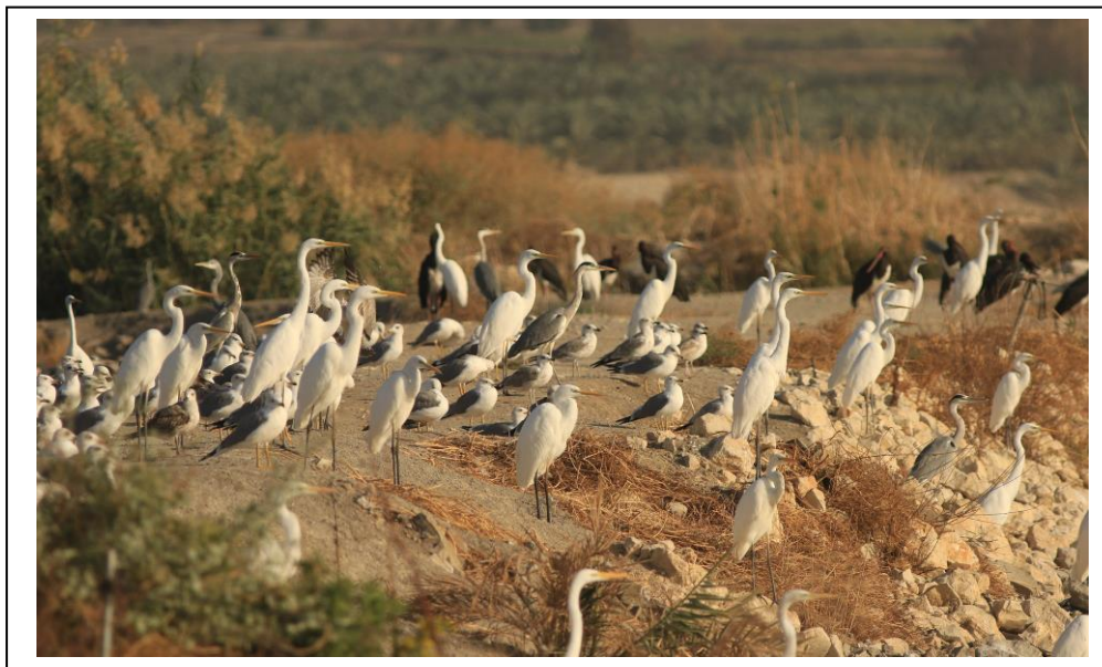
Egrets, Herons and Gulls, a water bird paradise

After meeting our guide at Ben-Gurion airport, we will head North along the Mediterranean coast towards the region of Ma'agan Michael. We will spend the morning exploring the area and getting acquainted with the more common species. This area is dominated by fish ponds that stretch alongside the beautiful beach. It won't be long before we see our first Western Marsh Harriers and Greater Spotted Eagles. It will be hard to ignore the many White-breasted and Pied Kingfishers, White Pelicans, Great Egrets, Black and White Storks, Eurasian Spoonbills and Glossy Ibises, as well as many shorebird species, at close quarters. In the early afternoon we will drive northeast to the legendary Hula Valley, arriving in time for dinner and a wrap up of the day's adventures. Overnight at Gonen Cottages.