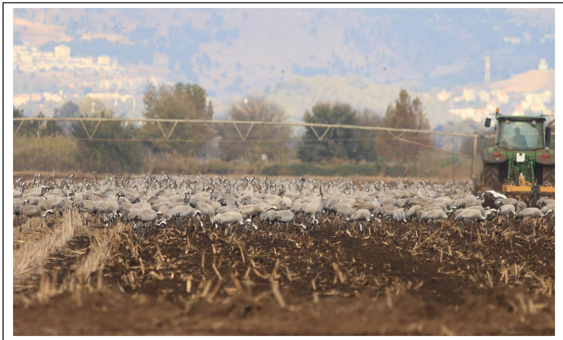
Cranes in the Hula Valley

A very early departure for our exclusive sunrise date with the Cranes at the Hula Valley Agmon Park. The park is of international importance for wintering Cranes with up to 40,000 spending the winter here. We will join a special tour in the Tractor-towed mobile hide, and get very up close and personal with the Cranes - a truly magical experience! Following the mobile hide trip we will head back to our hotel for breakfast and check out, after which we will return to the park, spending most of the day there.