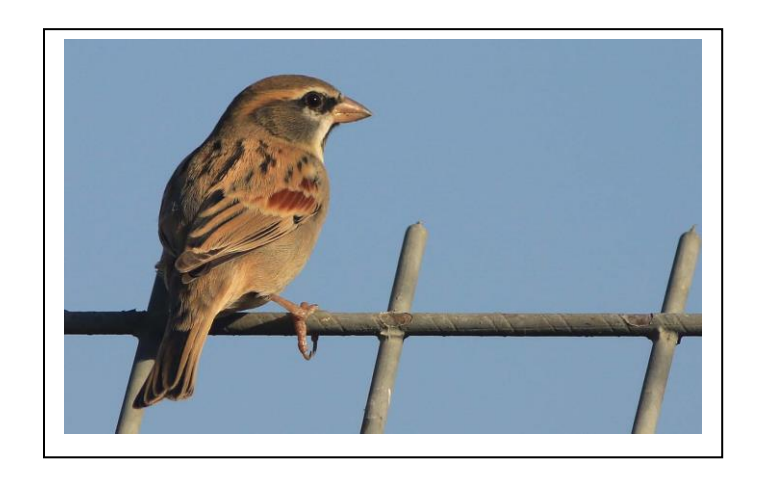
Dead Sea Sparrow

Eagles, Harriers, falcons and more. After a full day in the field, we will head back for a delicious home-cooked dinner and daily summary at the Jordan Valley Birding Centre Lodge, which is where we will spend the night.