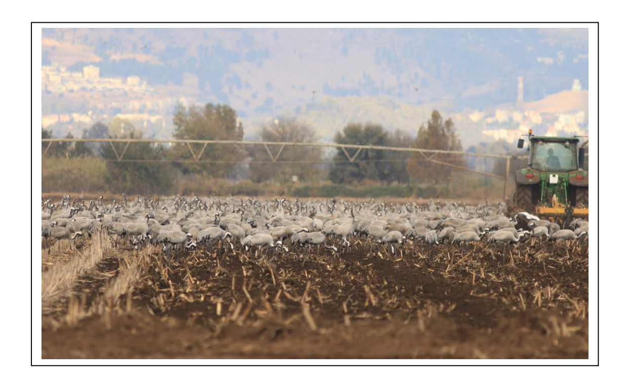
Cranes in the Hula Valley

A very early departure for our exclusive sunrise date with the Cranes at the Hula Valley Agmon Park. The park is of international importance for wintering Cranes with up to 40,000 spending the winter here. We will join a special tour in the Tractor-towed mobile hide, and get very up close and personal with the Cranes - a truly magical experience! Following the mobile hide trip we will head back to tour hotel for breakfast and check out, after which we will return to the park, spending most of the day there.