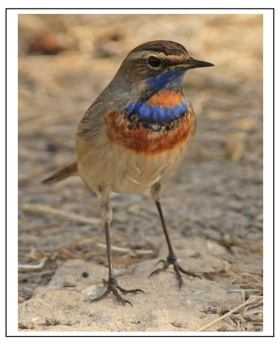
White-throated Kingfisher and Bluethroat