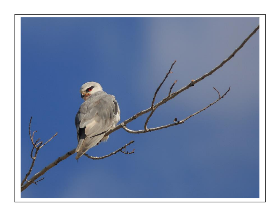
Black-shouldered Kite

Israel is a modern, comfortable and safe country to visit, offering fantastic infrastructure, great accommodation and famous hospitality following unforgettable days in the field.