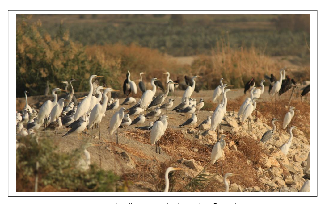
Egrets, Herons and Gulls, a water bird paradise

After meeting our guide at Ben-Gurion airport, we will head North along the Mediterranean coast towards the region of Ma'agan Michael. We will spend the morning exploring the area and getting acquainted with the more common species. This area is dominated by fish ponds that stretch alongside the beautiful beach. It won't be long before we see our first Western Marsh Harriers and Greater Spotted Eagles. It will be hard to ignore the many White-breasted and Pied Kingfishers, White Pelicans, Great Egrets, Black and White Storks, Eurasian Spoonbills and Glossy Ibises, as well as many shorebird species, at close quarters. In the early afternoon we will drive northeast to the legendary Hula Valley, arriving in time for dinner and a wrap up of the day's adventures. Overnight at Gonen Cottages.