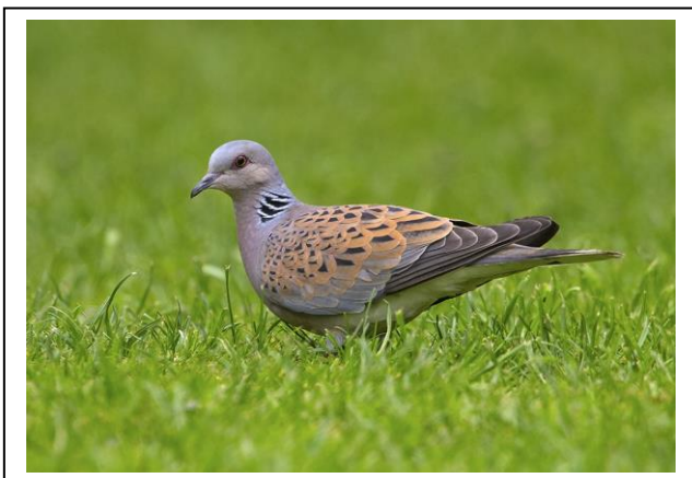
Turtle Dove

Every effort will be made to conduct the tour; however, in exceptional circumstances such as severe weather, Yorkshire Coast Nature reserves the right to change the content, guides or cancel the tour at short notice. In the event of cancellation by Yorkshire Coast Nature or Highfield Farm a full refund of the tour costs will be made. If you have any queries prior to the tour please call us on 07747753260.