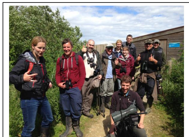
Happy clients on YCN tour 2014