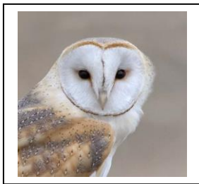
Barn Owl