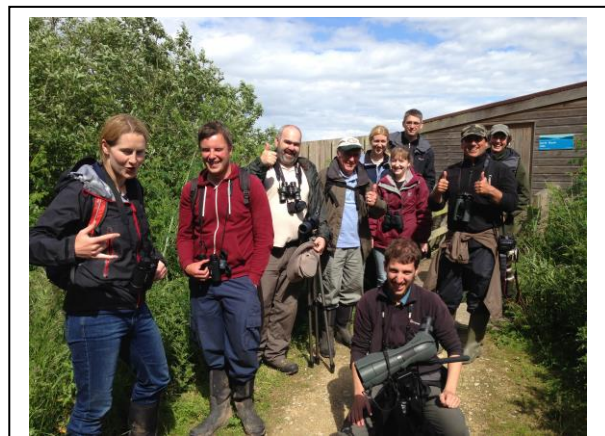
Happy clients on YCN tour 2014