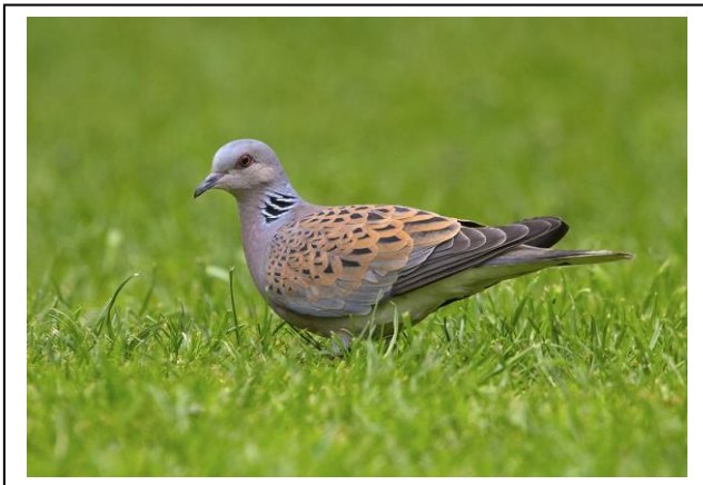
Turtle Dove

Every effort will be made to conduct the tour; however, in exceptional circumstances such as severe weather, Yorkshire Coast Nature reserves the right to change the content, guides or cancel the tour at short notice. In the event of cancellation by Yorkshire Coast Nature or Highfield Farm a full refund of the tour costs will be made. If you have any queries prior to the tour please call us on 07747753260.